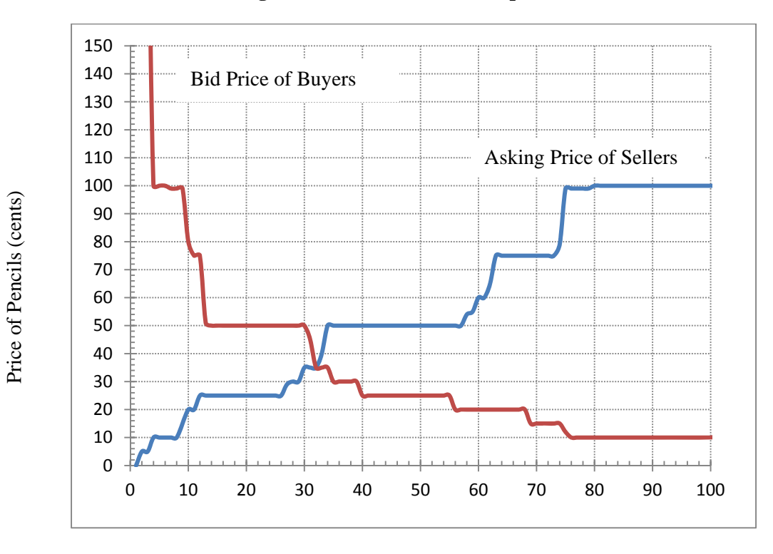
Figure 4. Bids in the Pencil Experiment