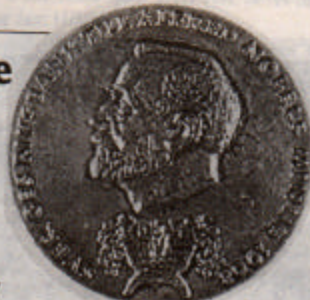
The Medal for the Prize in Economic Sciences in Memory of Alfred Nobel